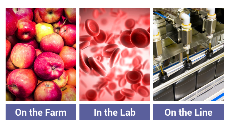
Combine NIRQuest with our line of light sources, accessories and software for a wide range of application challenges.

All NIRQuest spectrometer models have a replaceable slit design, increasing measurement flexibility. The freedom to adjust the width of the slit helps eliminate configuration trade-offs by giving users the ability to adapt spectrometer performance, without the need for recalibration. Also, users can add to NIRQuest an optional internal shutter, to manage light throughput and dark measurements. The shutter is useful for applications where placing an external shutter is difficult, such as emissive setups and probe-based measurements. Also, internal shutters are more convenient for applications where light intensities change, requiring users to dynamically adjust integration times and renormalize the spectrometer. Operation via software makes shutter control as simple as a few keystrokes.